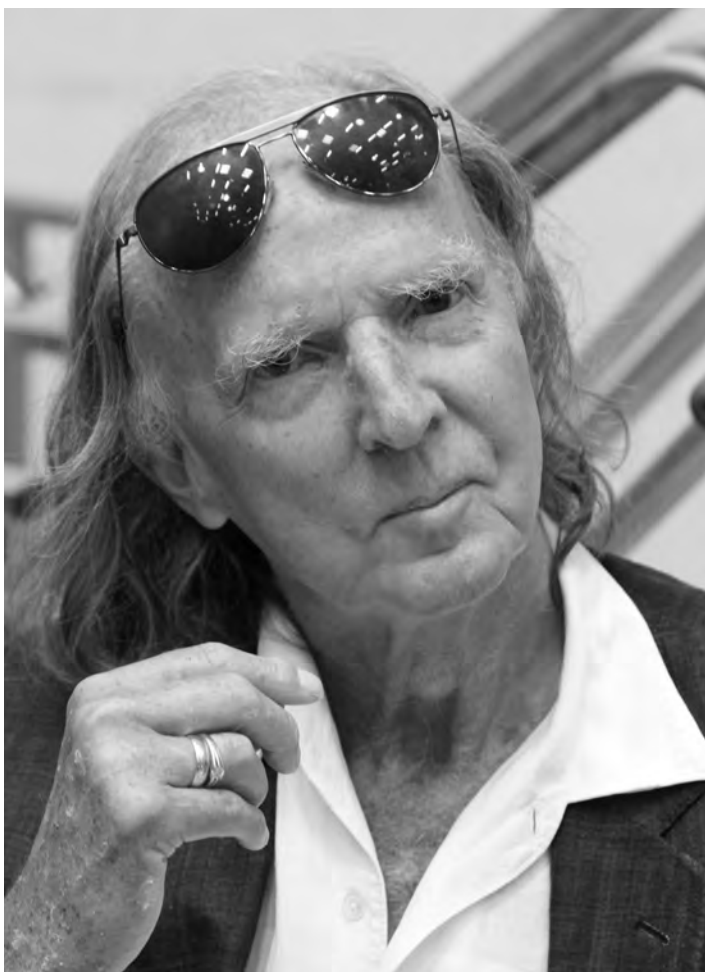
Manchester Festival, 2013

Ah! What was there in that candle's light? Oh, you struck fire in my heart, and I have been consumed! Oh, friend, come quickly! From the face of the heart, the Divine has appeared. Nothing can help me but that beauty. (Once, at dawn, my heart was shattered by your sweet odour!) My soul heard something from your soul. When my heart drank water from your spring, it drowned in you, And was borne away in its current.