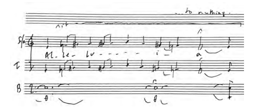
Wednesday 11<sup>th</sup> June 2014 Noon