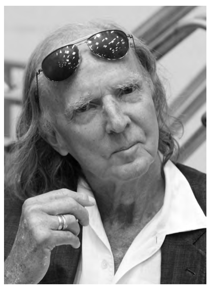
Manchester Festival, 2013

Ah! What was there in that candle's light?